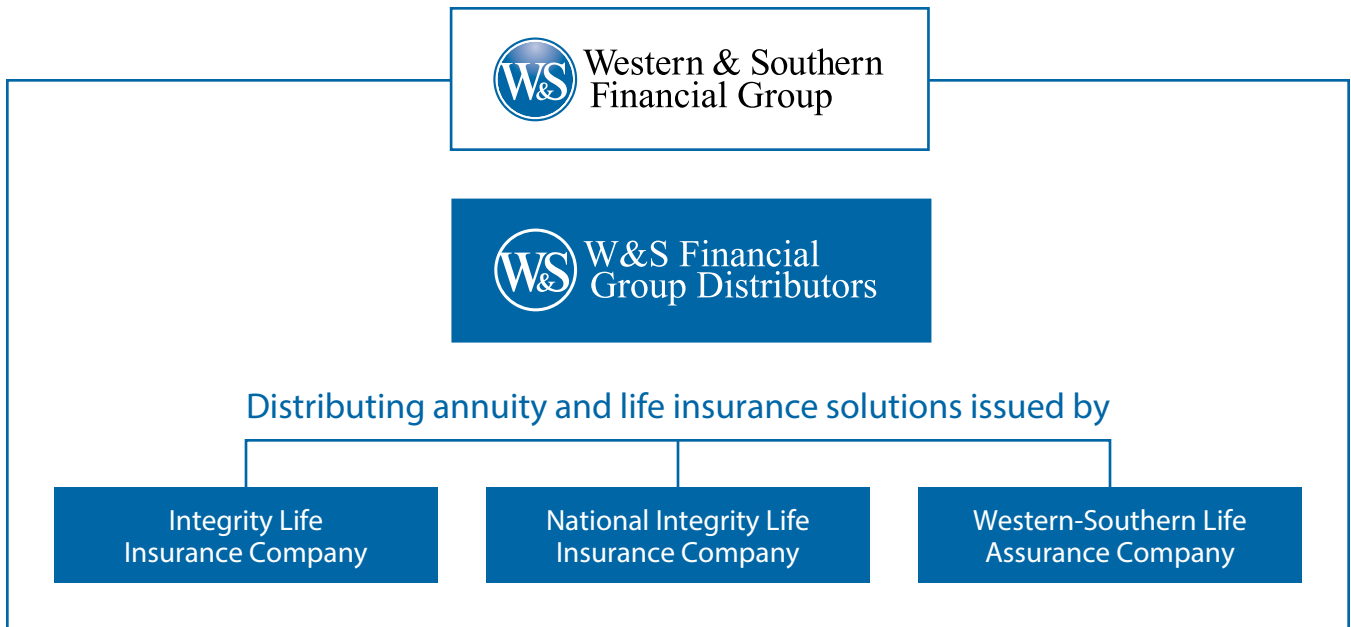
Chart is for illustrative purposes only and does not reflect the organization's legal structure.